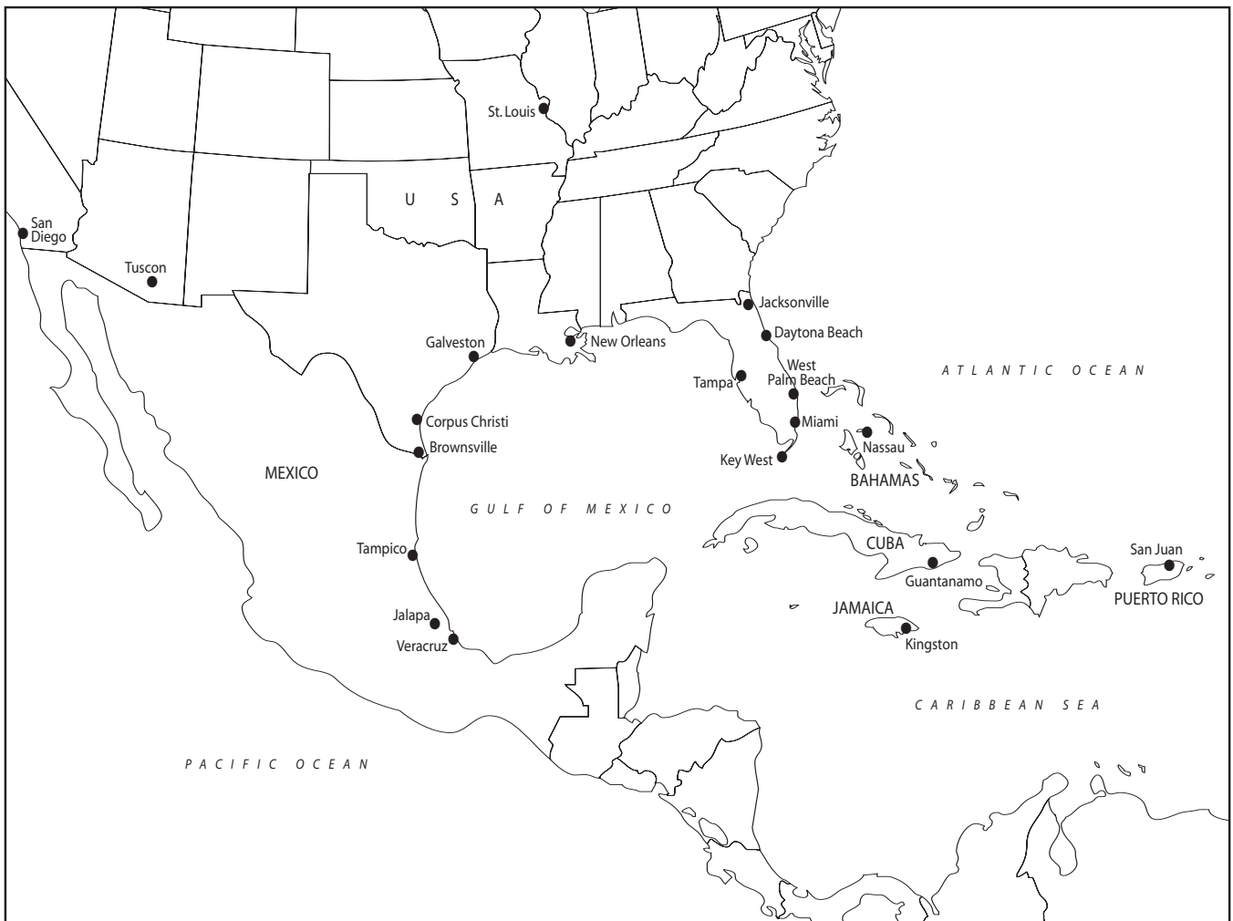
Map of the Caribbean